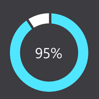
of Fortune 500 companies trust their business on Azure, the only cloud provider with 90+ compliance offerings.

Cloud computing offers measurable benefits and solutions to real problems, including aging hardware, barriers to innovation, data center capacity constraints, and even regulatory requirements. But moving Windows Server and SQL Server workloads can be daunting. Unless, of course, you choose a cloud provider that understands those workloads and has extensive experience across multiple companies and industries, including financial services and healthcare.